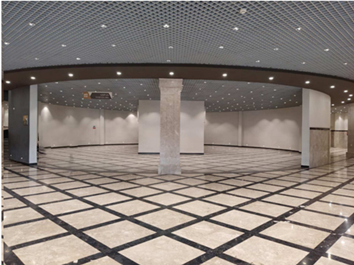
Photographs of the central portion as marked in the drawing. The theater will be setup inside the round shaped area located centrally in drawing